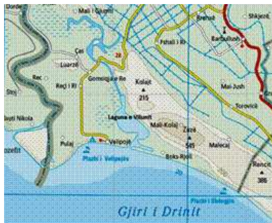
Figure 2: Topographical map of Velipoja area (Buna delta and Viluni lagoon).

months, due to high evaporation, the lagoon-sea communication is reduced.