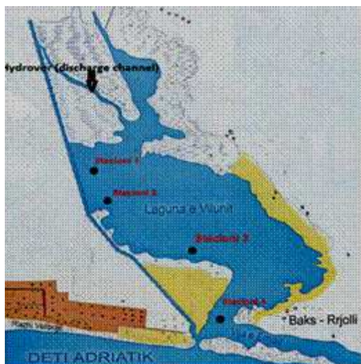
Figure 3: Map of the Viluni lagoon with sampling stations (October 2010)