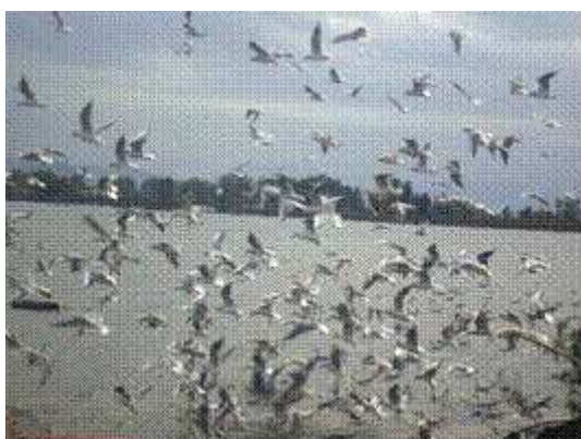
Figure 1: Above , view from Viluni lagoon; below , bird colony in Viluni lagoon.

The hydrodynamic processes are historically made up by alluvial deposits of Buna River. The Murteme drainage channel collects waters of Dajci lowlands. The Velipoja Hydrochannel collects waters of Velipoja lowland discharges also near the Viluni strait (Fig. 2). The coastal area near the Viluni lagoon is situated about 6 km nearby the Buna delta.